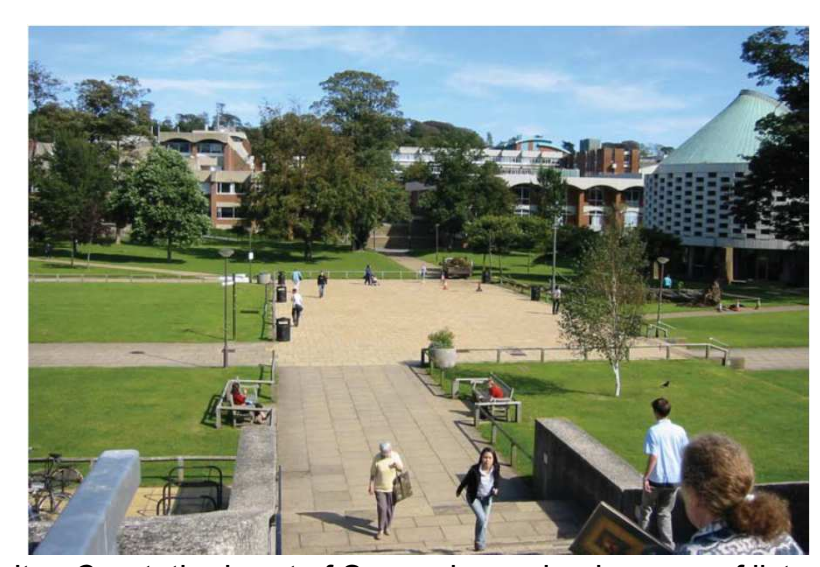
Fulton Court, the heart of Spence's academic group of listed buildings