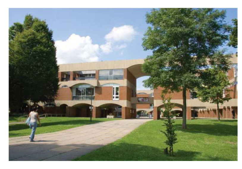
Falmer House, the Grade I listed Spence centrepiece building